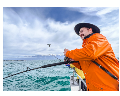
Enjoy time on the water, catching fresh fish for lunch. Breathtaking views are also a bonus while doing so.