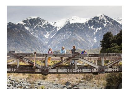
Discover beauty around every corner as you explore the back roads of Kaikōura