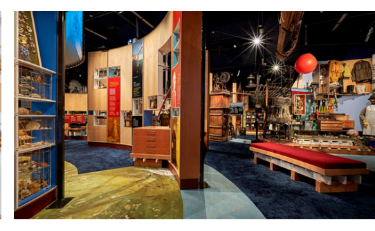
Kaikōura Museum Begin your journey to the museum with the creation of Kaikōura exhibition, and then follow your nose through the human history section to the natural wonders and marine life of the region. The entire museum involves both Pākeha and Māori cultures throughout.