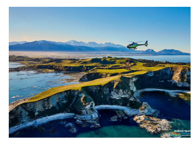
Soar above and with scenic flights either by helicopter or plane over the Kaikōura ranges