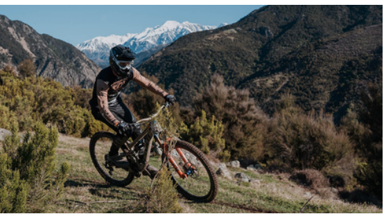
Middle HIII MTB The hill country on Middle Hill has been transformed in to a network of downhill mountain bike trails, waiting to be shredded! We'll drive you to the top of the hill, its up to you and your bike how you get back down

Kaikōura Peninsula Walkway Observe seals and seabirds, and enjoy clifftop views of the sea and mountains. Suitable for families, the whole walkway takes three hours but you can also explore a range of shorter tracks.