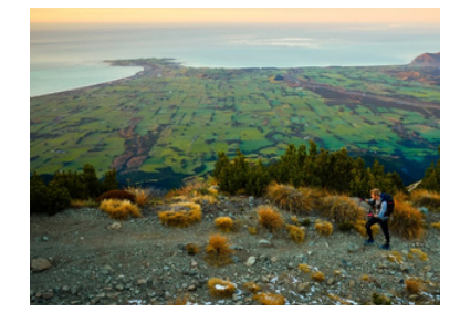
Mt Fyffe is one of the best day hikes on the South Island, with incredible mountain views in one direction and coastal views in the other.