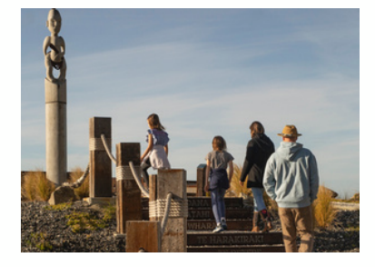
Visit the new Cultural Artwork safe stopping sites and learn about some of our Maori culture & history in Kaikōura