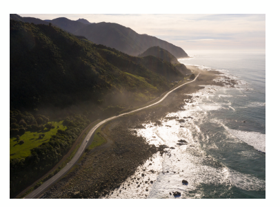
Take a scenic drive along the coastal corridor, taking time to explore the stop off areas along the way.