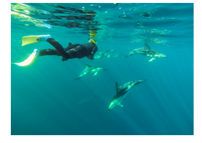
Swim with pods of the acrobatic and social Dusky Dolphin or head out and visit our giant Sperm Whales