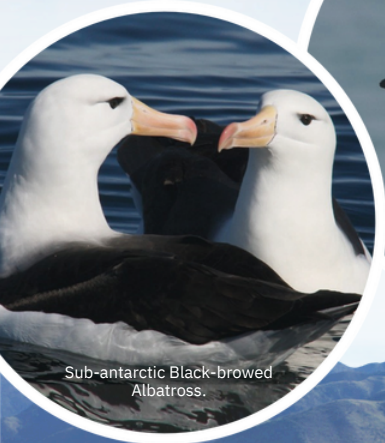
Sub-antarctic Black-browed Albatross.