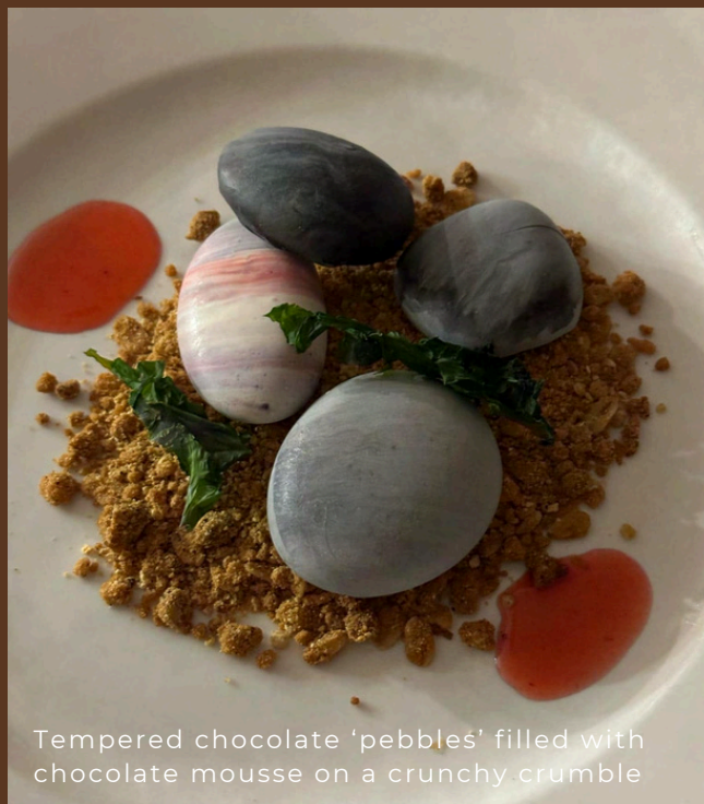
Tempered chocolate 'pebbles' filled with chocolate mousse on a crunchy crumble

Chef Cullen is passionate about highlighting local producers and creating fine dining experiences.